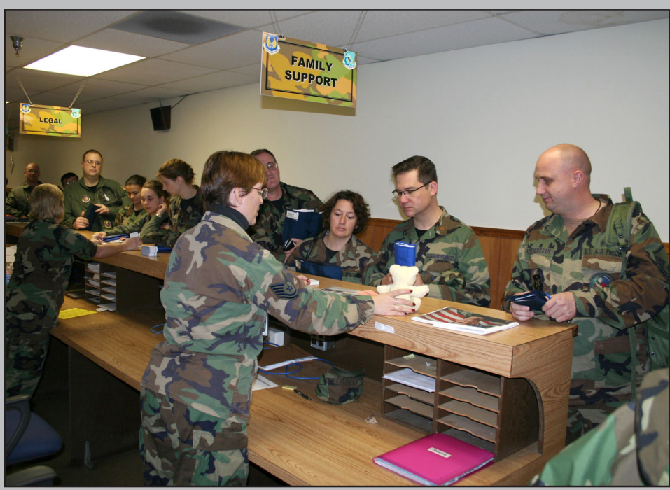
Reservists walk through the mobility line Jan. 6 preparing for the upcoming ORI in February of 2008. The mobility line consists of different specialists located in a centralized location to make sure all reservists are current and prepared to deploy.

Perhaps the reason the exercise moved quickly was the new procedures being used by base supply. "This is the first time that bags are being built specifically for an individual," said Michael Patrick of Base Supply. "If it works well with