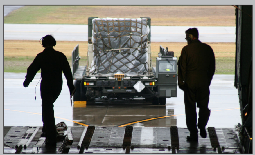
Loadmasters from the 89th Airlift Squadron are silhouetted as they prepare to receive cargo on a C-5 from a 60K loader.