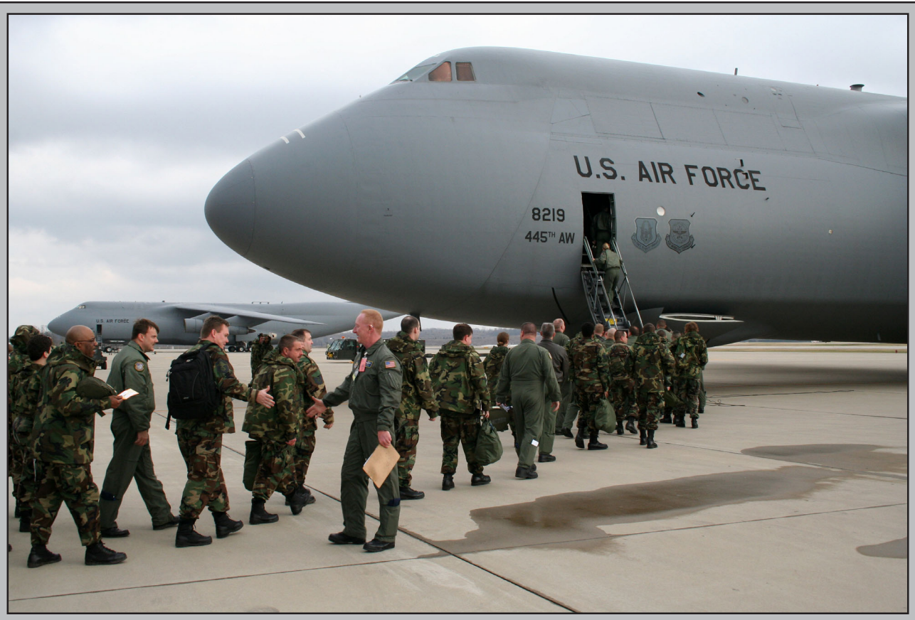
Reservists walk toward the awaiting C-5 for a flight simulating a real deployment to another location.